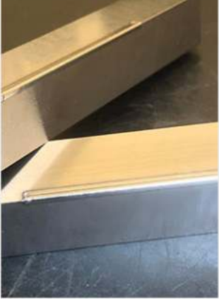
Mantle's printed H13 part post laser welding