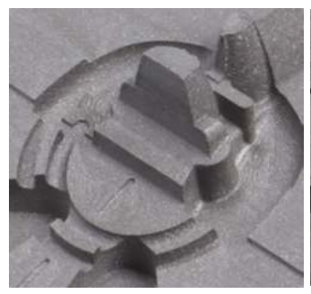
Fathom tool after Mantle's TrueShape process

Surface roughness after burning: a value of ~0.6-0.8 micron was achieved with graphite (C3) electrode - similar performance as a traditional H13 tool steel.