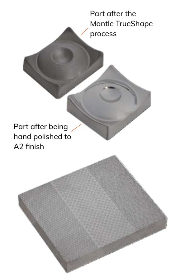
Example of chemical and laser texturing performed to Mantle's printed H13