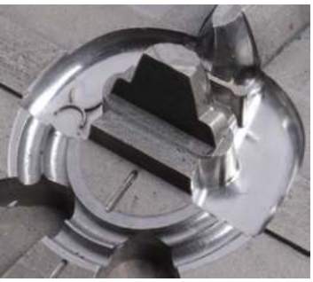
Fathom tool after sinker EDM and polishing operations