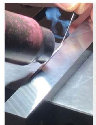
Laser welding of the Mantle printed H13 part