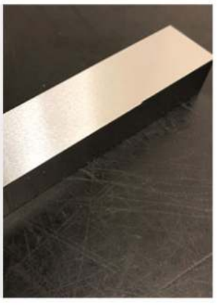
The Mantle printed H13 part post laser welding and grinding