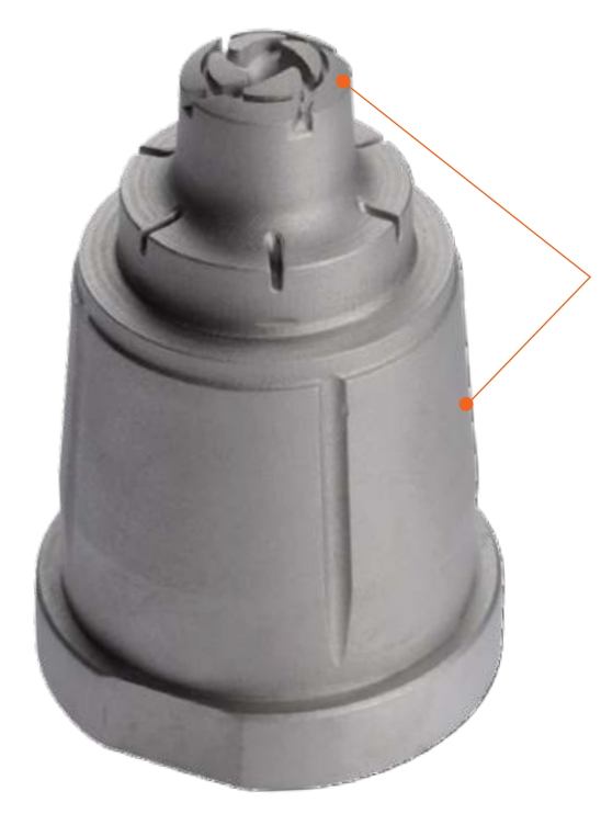
Shut off surfaces showed no signs of wear